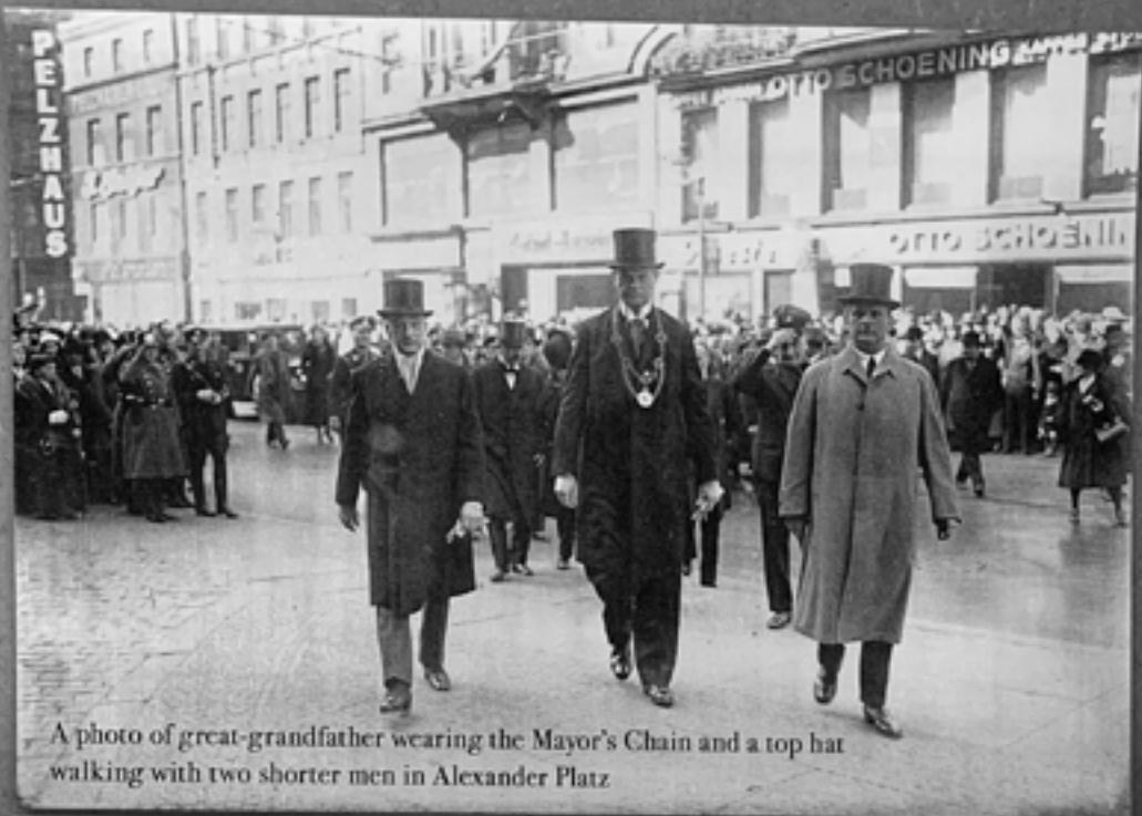
A photo of great-grandfather wearing the Mayor's Chain and a top hat walking with two shorter men in Alexander Platz

A photo from Getty Images that cost me 2457 NIS Although I asked them really nicely to use it for free because it's my great-grandfather and it's art.